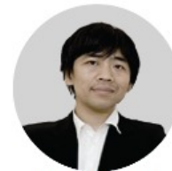
Ryue Nishizawa* Co-founder of SANAA