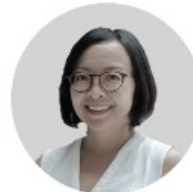
Devisari Tunas Future Cities Laboratory