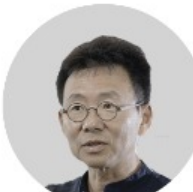
Huang Sheng-Yuan Fieldoffice Architects, Taiwan