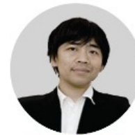
Ryue Nishizawa* Co-founder of SANAA